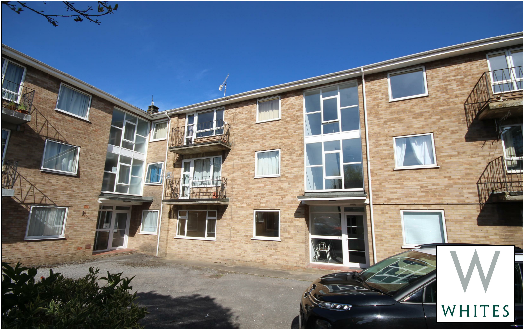
13 Cleveland Flats, Fair View Road, Salisbury, Wiltshire, SP1 1JY